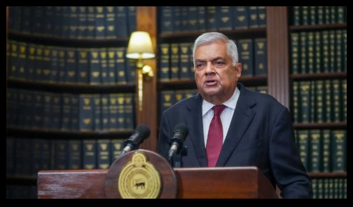
Debt repayments