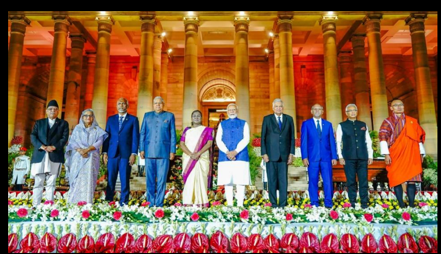
Swearing- in ceremony

deal with hundreds of former soldiers deployed in Russia's war with Ukraine. Returnees and families of the ex-soldiers have complained that they were lured to Russia as camp helpers and then forced to fight on the front lines. Now SL mercenaries fighting on the Russian side in the Russia-Ukraine war should receive up to RUB 03 million (LKR 10,740,257.48) in compensation if they are injured.