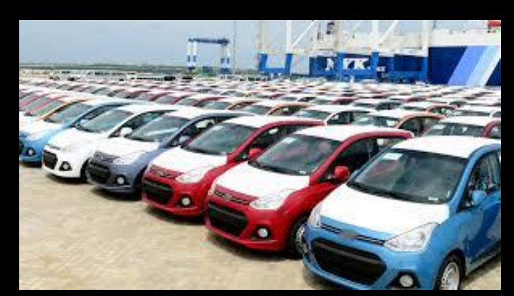
Car Import

28.06.2024: Bank -According to Economy Next, SL's Central Bank has announced that the Banking (Amendment) Act No. 24 of 2024, which aims to strengthen the legal and regulatory framework for licensed commercial banks and licensed specialised banks, is in force from 15.06.2024. This should improve the resilience of the banking sector in SL.