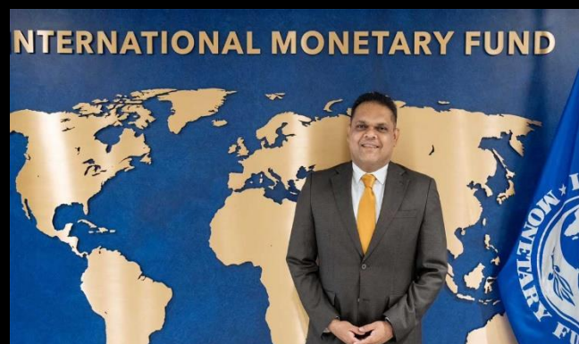
Debt Reduction

30.04.2024: SOE - According to Economy Next, SL's main state-owned enterprises (SOEs) have reversed their losses in 2022 and will make profits in 2023. SL is in the process of implementing comprehensive reforms in SOEs, including the sale and privatisation of some key companies and reducing the bloated SL state sector.