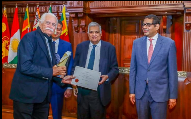
Investment Zone

25.04.2024: Interest rates - According to Economy Next, the 15 % interest rate offered to seniors has now dropped to 8-7 %, even lower in some places. Senior citizens are demanding government intervention to raise the interest rate back to 15 %. SL will require LKR 40 billion a year to increase the interest rate offered to senior citizens on their savings.