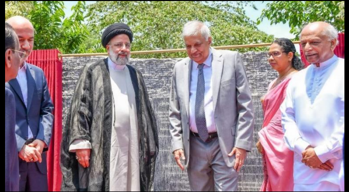
Global South

26.04.2024: Germany - According to Economy Next, SL has allowed a German research vessel to call at the port of Colombo for the second time after SL's foreign ministry issued a clarification following a Chinese protest. The Chinese embassy in Colombo had strongly protested against the authorisation of a German research vessel in early March 2024 after SL's authorities rejected a request from Beijing for a research vessel in February 2024. SL's Ministry of Foreign Affairs stated that SL will allow research vessels from abroad to dock in its state's harbours despite the 01-year ban.