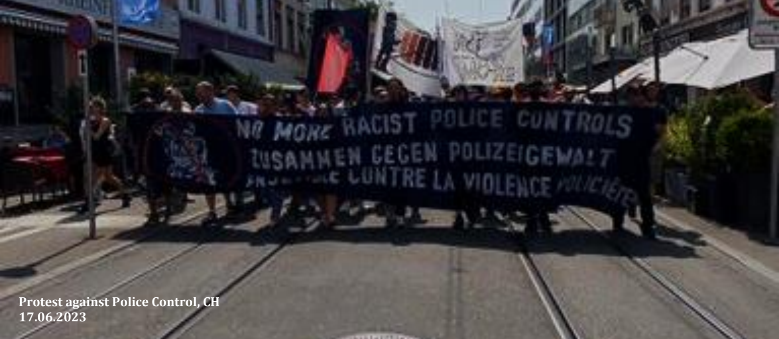
Protest against Police Control, CH 17.06.2023