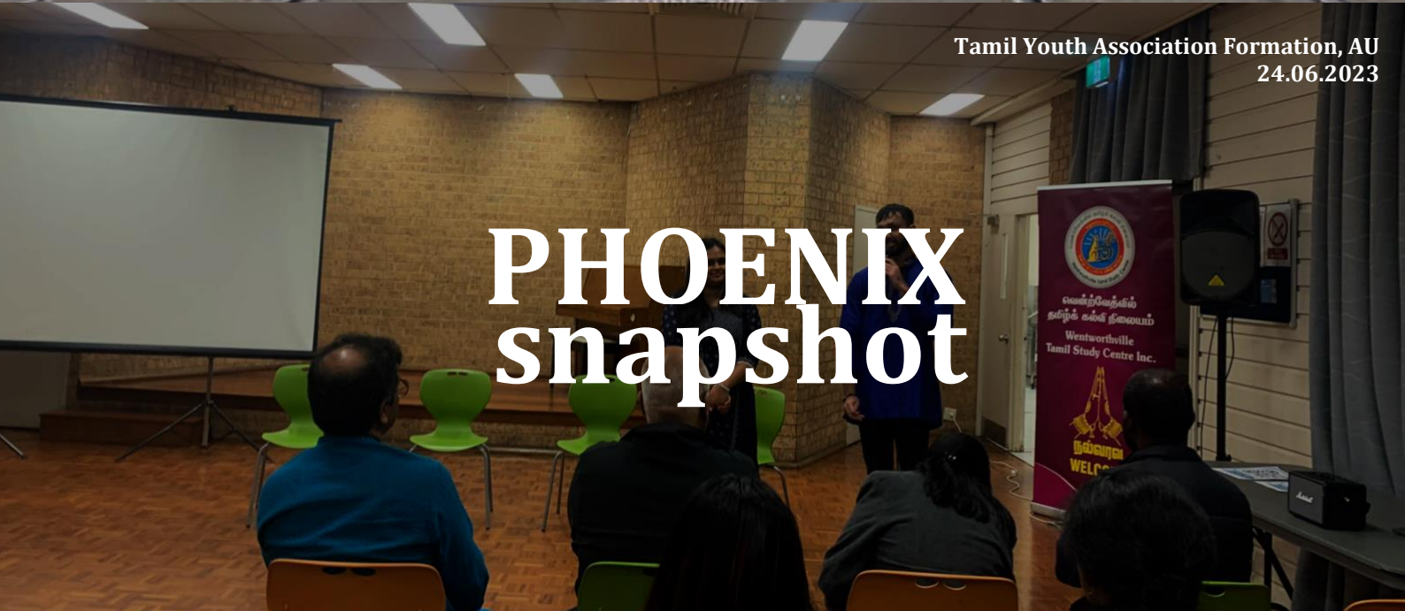
Tamil Youth Association Formation, AU 24.06.2023