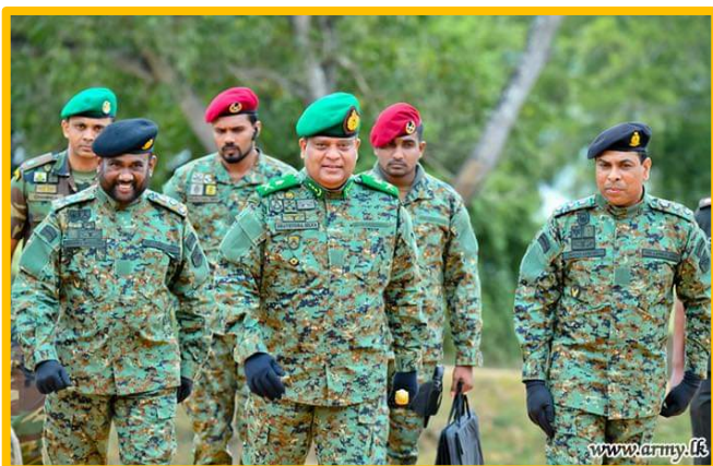
A new digitised uniform released for elite SL officers.

night operations. It was reported that similar techniques are used by the US and UK military.