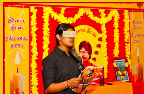
Images of youth in Sydney engaged in the local commemorative event co-organised by the youth.