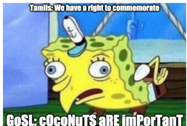
Coconut Meme

30.09.2020: Inflation - Inflation in SL is currently 4%. SL is putting a lot of money into circulation, which is causing stock prices to rise, Economy Next reports.