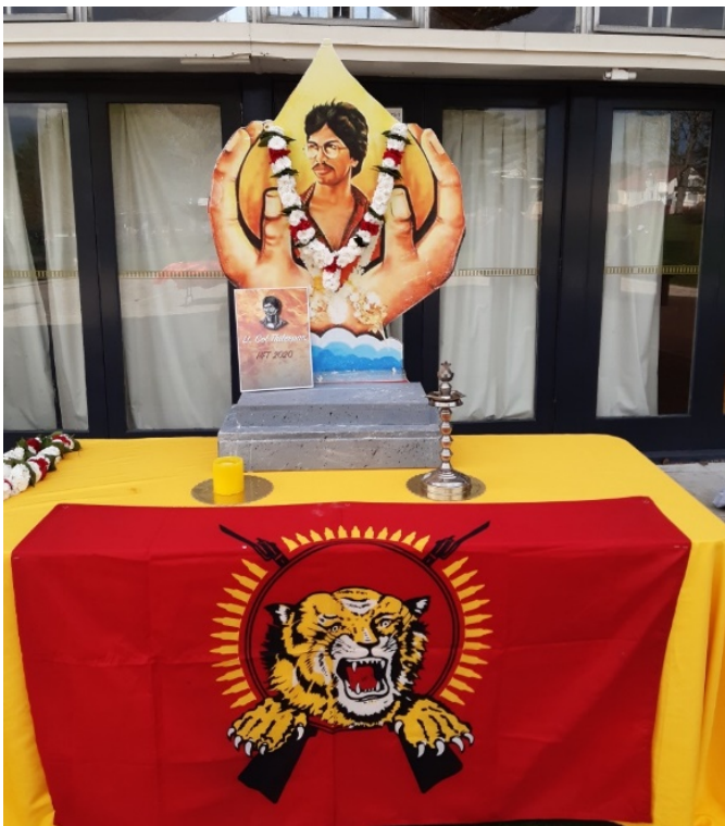
The HFT2020 Convention booklet developed through the combined efforts of over 25 youth from Australia and New Zealand dedicated to Lt. Col. Thileepan during the local commemorative event in New Zealand.

Furthermore, over 25 youth from Australia and New Zealand had compiled a 50-page convention booklet including: