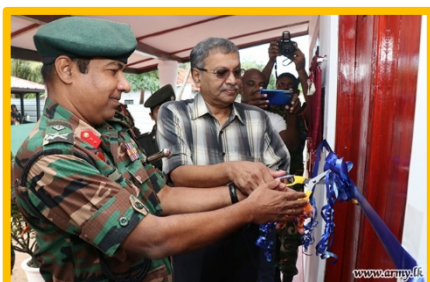
A "Harmony Centre" was unveiled in Kopay with the financial assistance of the "Thiyahie Charitable Trust" to encourage civil-military cooperation.