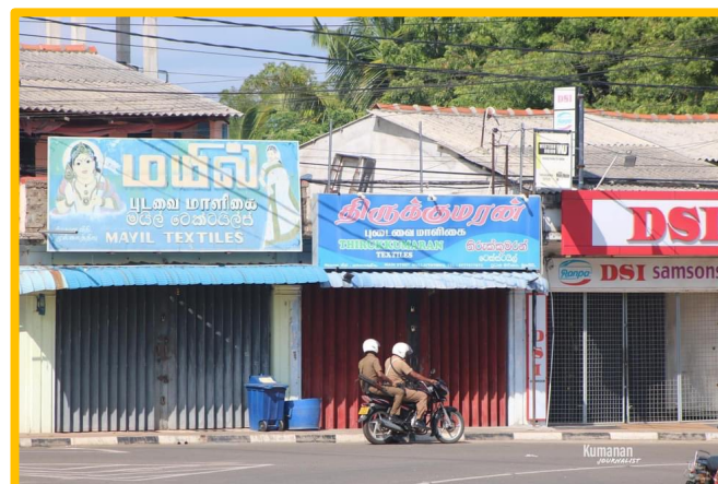
Occupational police seen during Hartal in the Tamil homeland following states restriction of memorialization for Lt. Col. Thileepan.

12.09.2020: Lt. Col. Thileepan – In response to a hunger strike commenced by SL's high-level criminals at Boosa High Security Prison, Kamal Gunaratne had mentioned that all hunger strikes in Sri Lanka had been stopped within their early stages in the country where only Lt. Col. Thileepan's had proceeded to death due to his illnesses, reported defence.lk. Such delegitimation of the legacy of Lt. Col. Thileepan has a tendency to be a sign of structural genocide in regard to destructing the distinct history of Tamil resistance.