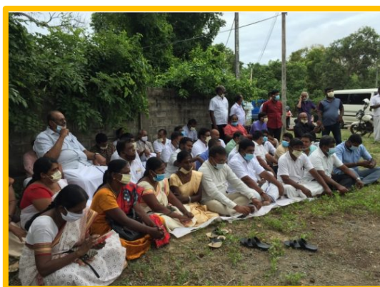
Tamil politicians pictured protesting to commemorate Lt. Col. Thileepan.

28.09.2020: Protest - According to Daily Mirror, Tamils staged a hartal in protest to the ban issued by the Northern Provincial courts banning the commemoration of Lt. Col. Thileepan. The shop owners in; Jaffna, Kilinochchi, Mullaitivu, Vavuniya and Mannar put up shutters and closed businesses for the day. All shops, schools and privately-owned buses were closed leaving pharmacies, restaurants and SLTB buses in operation. The hartal was initiated following the SL government's injunction against commemorating the death anniversary of Lt. Col. Thileepan, reports Colombo Page.