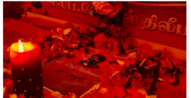
The HFT2020 Convention booklet developed through the combined efforts of over 25 youth from Australia and New Zealand dedicated to Lt. Col. Thileepan during the local commemorative event in Sydney, Australia.

In addition to participation in the 30-hour symbolic hunger strike and the online commemorative events, the Eelam Tamil youth of Australia and New Zealand had organised the first HFT2020 Convention. This convention was held online due to COVID-19 restrictions. However, it is noteworthy that this convention will be held in an annual manner as a part of the global HFT campaign. The theme for this year's convention was, “The Multi-dimensions of Lt. Col. Thileepan's Struggle for Tamil Liberation”