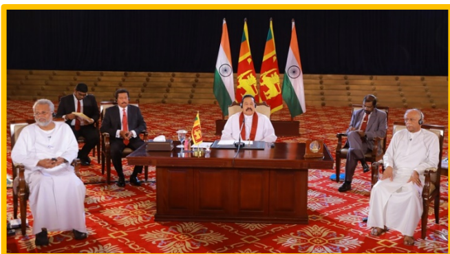
Modi and Mahindha's discussions through a virtual meeting.

implementation of the 13th Amendment to the Sri Lankan Constitution and promoted working towards issues of Tamils and achieving reconciliation in a unified state. Modi announced a grant assistance of USD 15 million for the promotion of Buddhist ties between the two countries, according to the Colombo Gazette and Colombo Page.