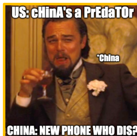
US vs. China Meme