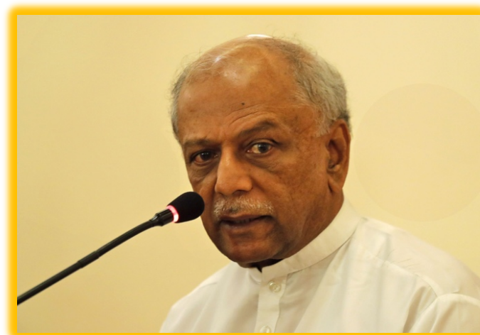
Foreign Minister for Sri Lanka, Dinesh Gunawardena.

29.06.2020: US – The Spokesman of the US Department of State, Ortagus and Secretary of State, Pompeo had spoken with Dinesh Gunawardena to discuss issues of mutual interest and reaffirmed their commitment to SL's sovereignty and development, reports Colombo Gazette. Gunawardena was also reported to have updated Pompeo regarding the MCC Review. According to Sunday Times LK, US-SL cooperation in COVID-19 crisis management had included bilateral assistance amounting to USD 5.8 million.