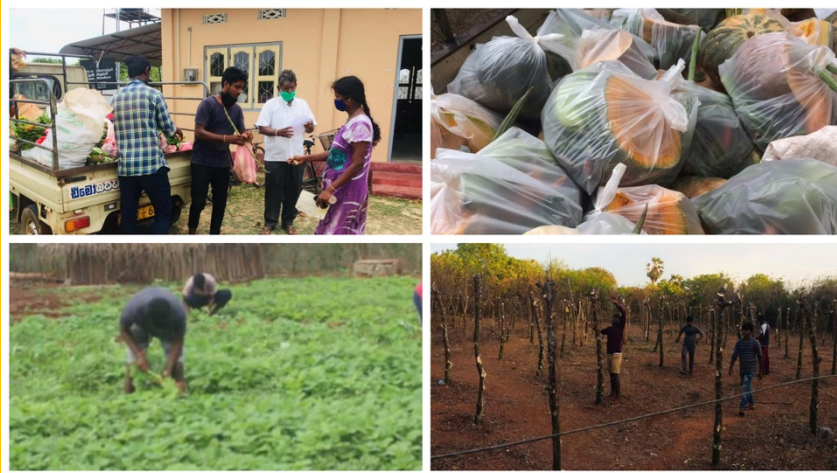
Jaffna University students successfully cultivate on 10 acres of barren land and participate in distribution of goods for pandemic relief.