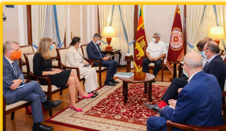
European Ambassadors meet with Sri Lanka's president.

18.06.2020: EU – EU Ambassadors in SL had met with Gotabaya to discuss the development of SL's economy following the COVID-19 pandemic, reports Colombo Gazette.