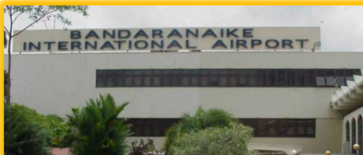
Bandaranaike International Airport waves PCR testing for US diplomat.

04.06.2020: US - According to Newswire.lk, an US diplomat had skipped the PCR test at the Bandaranaike International airport with his diplomatic immunity.