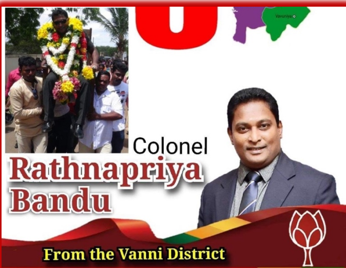
Former Civil Defence Force Commander runs as SLPP candidate for Vanni District. Source: Newswire.lk