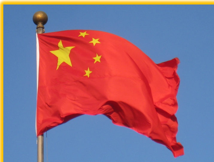
China's Flag

Bank (CDB) would deliver another concessionary loan of USD 140 million – USD 70 million before the end of this month and the remainder by the end of the year - to tide over the present financial problems.