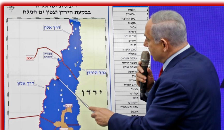
Sri Lanka reported to have requested Israel to cease annexation of West Bank.