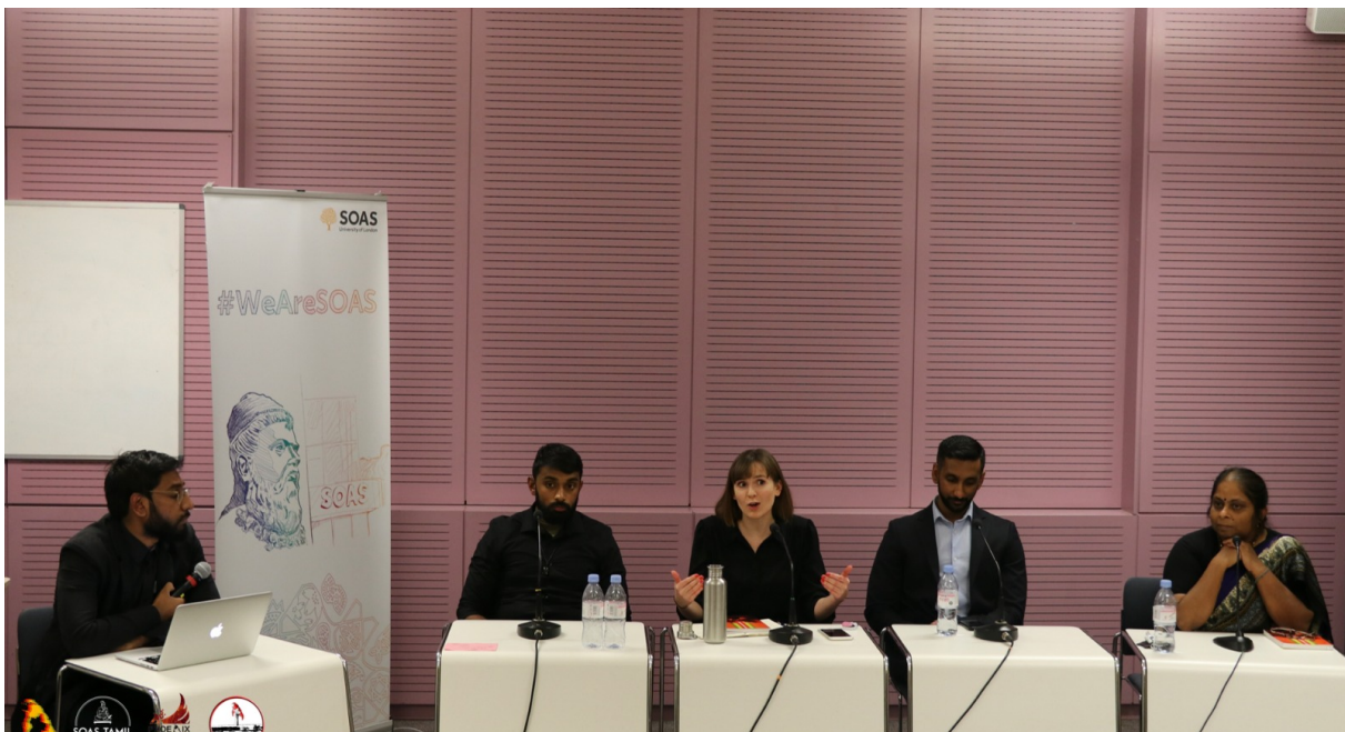
The book launch at the SOAS university

Phoenix's projects for Maaveerar month targeted social media platforms which continue to be exploited and weakened by genocidal forces to bridge the gap and strengthen cohesion between the widespread Tamil diaspora network. Such attempts function as a prelude to future initiatives that must be undertaken to counter the rigorous escalation of censorship which impends with Sri Lanka's president-elect's expertise within the field of IT.